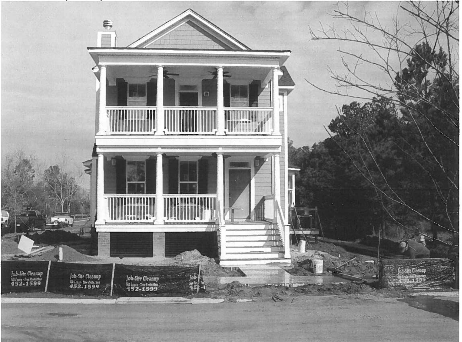
HOUSE FRONT (02/15/07)