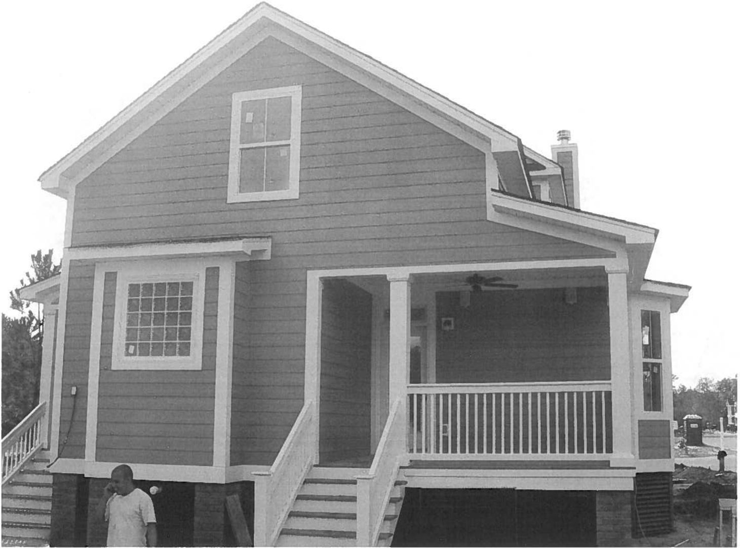
HOUSE REAR (02/15/07)