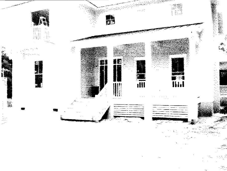
37431 FRONT VIEW

If using the Elevation Certificate to obtain NFIP flood insurance, affix at least two building photographs below according to the instructions for Item A6. Identify all photographs with: date taken; "Front View" and "Rear View"; and, if required, "Right Side View" and "Left Side View." If submitting more photographs than will fit on this page, use the Continuation Page, following.