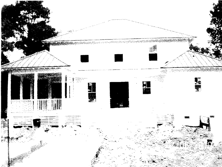
37431 REAR VIEW