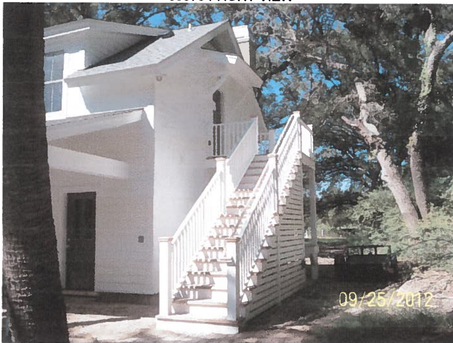
39576 REAR VIEW