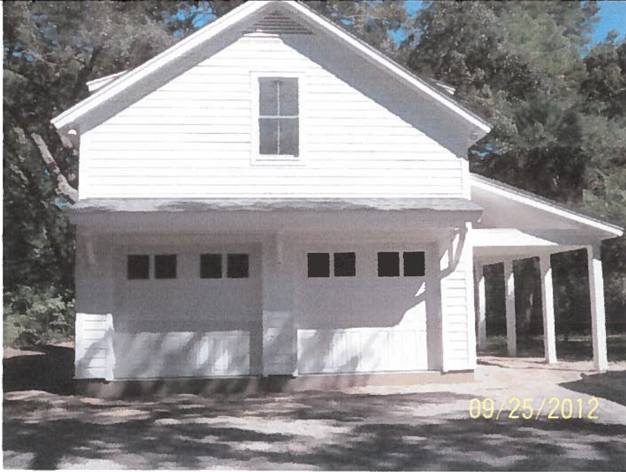
39576 FRONT VIEW

If using the Elevation Certificate to obtain NFIP flood insurance, affix at least two building photographs below according to the instructions for Item A6. Identify all photographs with: date taken; "Front View" and "Rear View"; and, if required, "Right Side View" and "Left Side View." If submitting more photographs than will fit on this page, use the Continuation Page, following.