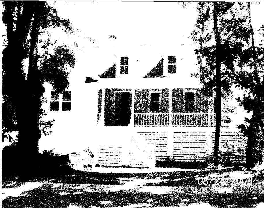
36569 FRONT VIEW

If using the Elevation Certificate to obtain NFIP flood insurance, affix at least two building photographs below according to the instructions for Item A6. Identify all photographs with: date taken; "Front View" and "Rear View"; and, if required, "Right Side View" and "Left Side View." If submitting more photographs than will fit on this page, use the Continuation Page, following.