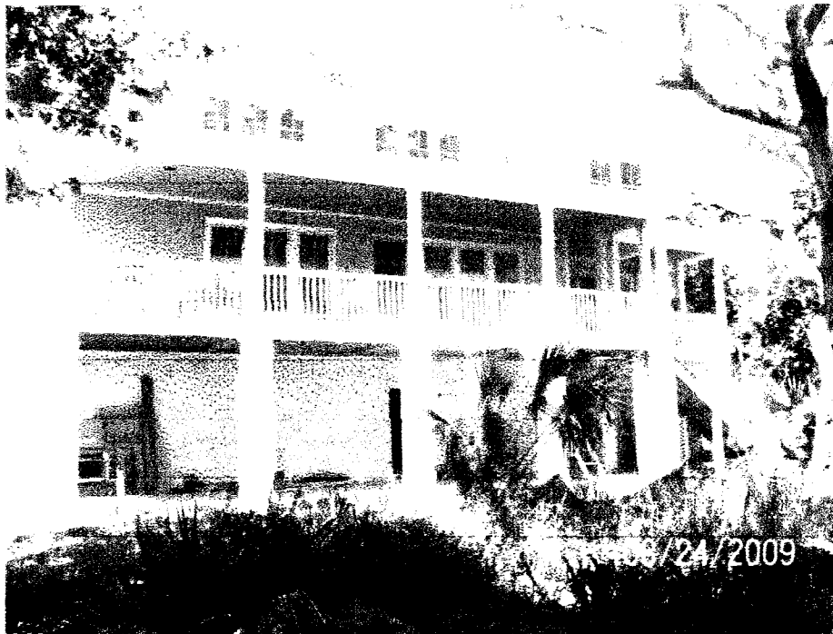
36569 REAR VIEW