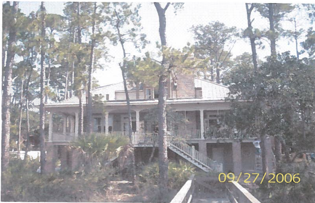
32338 REAR VIEW