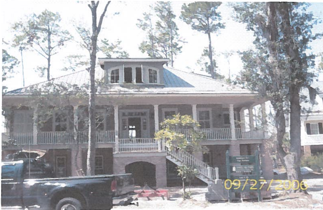
32338 FRONT VIEW

If using the Elevation Certificate to obtain NFIP flood insurance, affix at least two building photographs below according to the instructions for Item A6. Identify all photographs with: date taken; "Front View" and "Rear View"; and, if required, "Right Side View" and "Left Side View." If submitting more photographs than will fit on this page, use the Continuation Page, following.