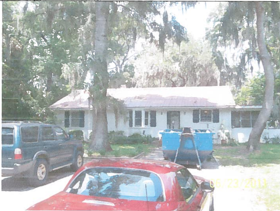
38345 FRONT VIEW

If using the Elevation Certificate to obtain NFIP flood insurance, affix at least two building photographs below according to the instructions for Item A6. Identify all photographs with: date taken; "Front View" and "Rear View"; and, if required, "Right Side View" and "Left Side View." If submitting more photographs than will fit on this page, use the Continuation Page, following.