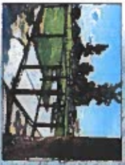
Dog Park Entry