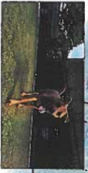
K9 Grass (Artificial Turf)