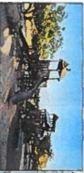
Playground and Safety Surface