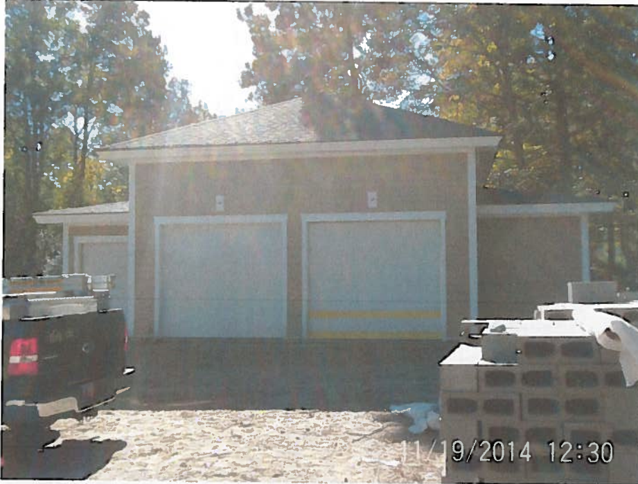
42547 GARAGE FRONT VIEW

If using the Elevation Certificate to obtain NFIP flood insurance, affix at least 2 building photographs below according to the instructions for Item A6. Identify all photographs with date taken; "Front View" and "Rear View"; and, if required, "Right Side View" and "Left Side View." When applicable, photographs must show the foundation with representative examples of the flood openings or vents, as indicated in Section A8. If submitting more photographs than will fit on this page, use the Continuation Page.