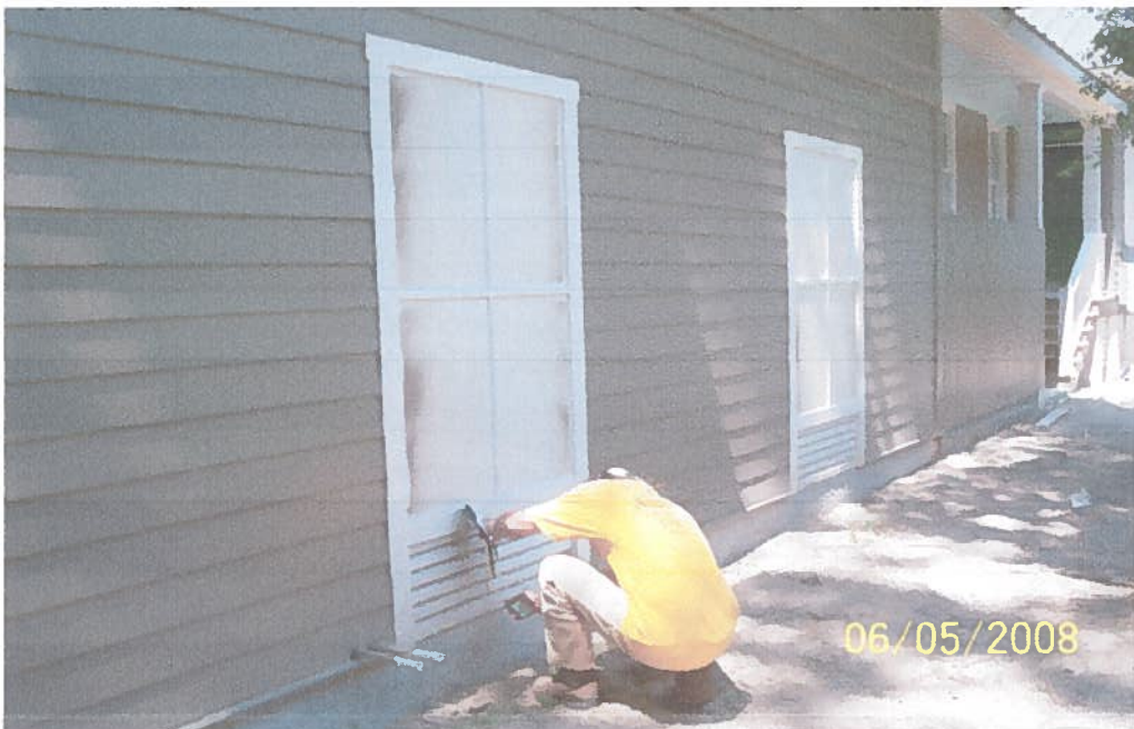
35235 REAR GARAGE VIEW