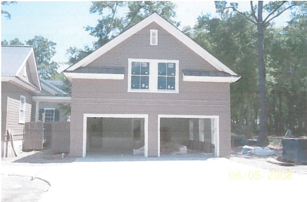
35235 FRONT GARAGE VIEW

If using the Elevation Certificate to obtain NFIP flood insurance, affix at least two building photographs below according to the instructions for Item A6. Identify all photographs with: date taken; "Front View" and "Rear View"; and, if required, "Right Side View" and "Left Side View." If submitting more photographs than will fit on this page, use the Continuation Page, following.