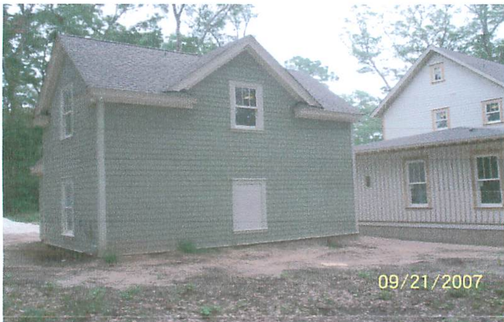
34235 REAR GARAGE VIEW