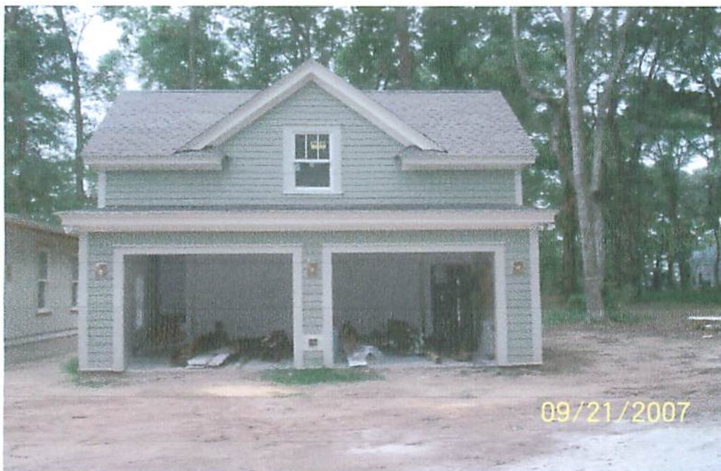
34235 FRONT GARAGE VIEW

If using the Elevation Certificate to obtain NFIP flood insurance, affix at least two building photographs below according to the instructions for Item A6. Identify all photographs with: date taken; "Front View" and "Rear View"; and, if required, "Right Side View" and "Left Side View." If submitting more photographs than will fit on this page, use the Continuation Page, following.