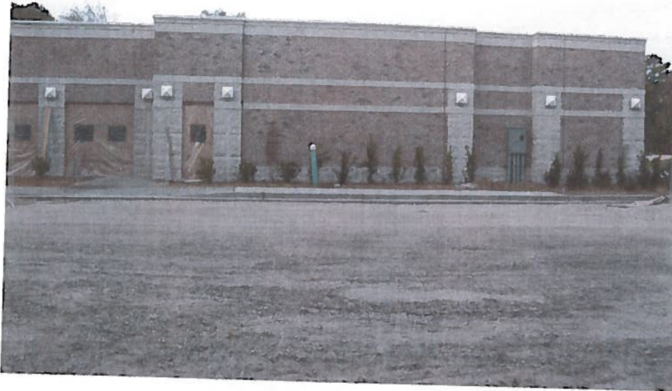
"Side View" 12/4/07

If submitting more photographs than will fit on the preceding page, affix the additional photographs below. Identify all photographs with: date taken; "Front View" and "Rear View"; and, if required, "Right Side View" and "Left Side View."