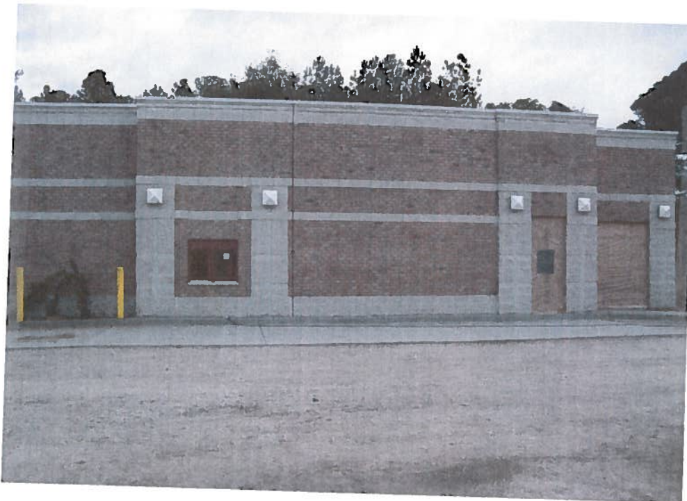
"Side view" 12/4/07