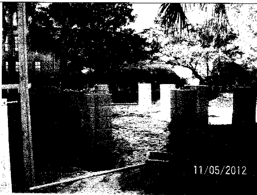
39696 FRONT VIEW

If using the Elevation Certificate to obtain NFIP flood insurance, affix at least two building photographs below according to the instructions for Item A6. Identify all photographs with: date taken; "Front View" and "Rear View"; and, if required, "Right Side View" and "Left Side View." If submitting more photographs than will fit on this page, use the Continuation Page, following.